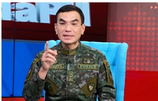
PNP Chief Gen. Eleazar praises police for killing five civilians.