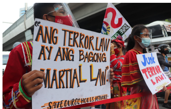
Terror Law is the new Martial Law.

But eventually it is the people, in the midst of the growing revolutionary movement, that will oust him before or after the 2022 elections. This will be a significant step in the process of attaining national sovereignty and true democracy towards a just and lasting peace. UP