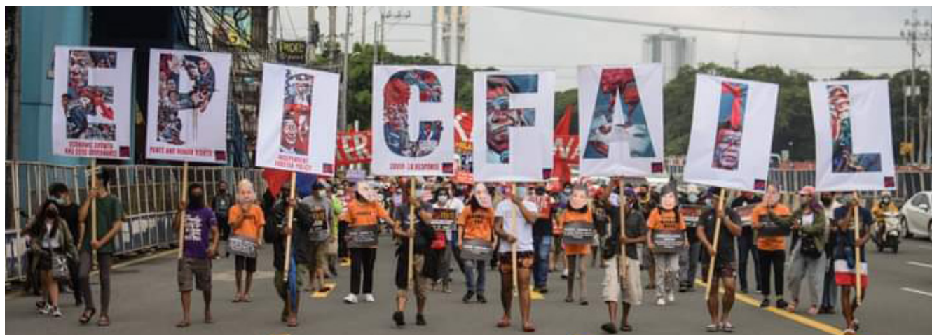
The real State of the Nation.