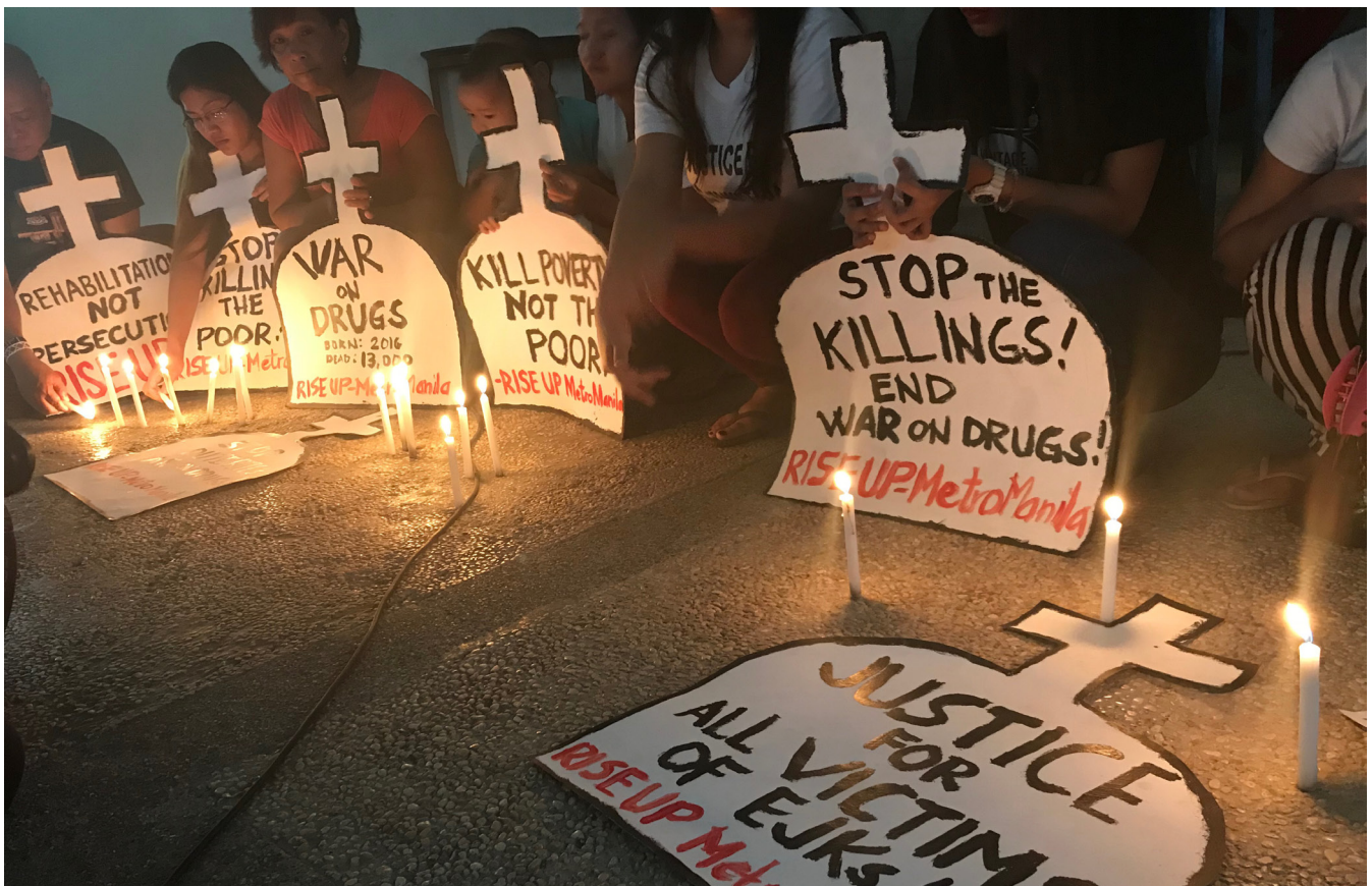
Justice for all victims of extrajudicial killings!