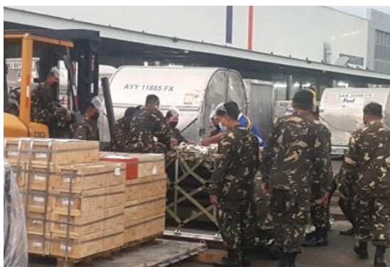
US arms delivery to AFP.