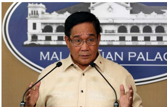
National Security Adviser Gen. Hermogenes Esperon, Jr.

“We will turn our grief into strong indignation and protest this government that kills its people,” the KMP said. UP