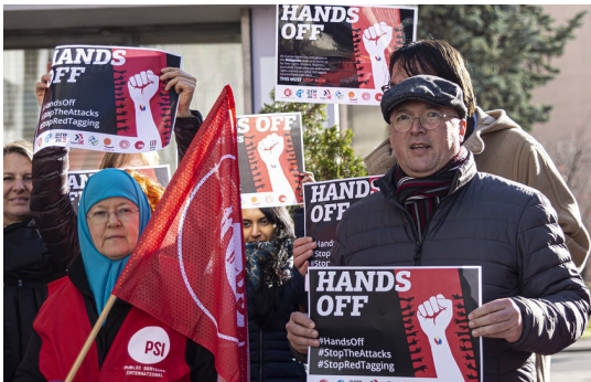
Officials of IndustriALL Global Union protest against growing repression in the Philippines.

Our hopes for a just and lasting peace must then rest on uniting in greater numbers, facing greater challenges and sacrifices and fighting more resolutely to see an end to the tyrannical regime. UP