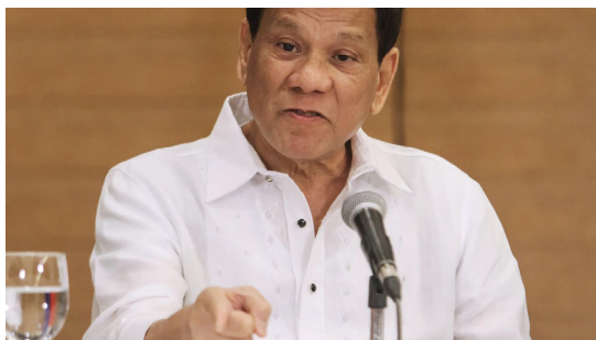
Security agents of President Rodrigo Duterte continue armed operations against Filipino people despite ceasefire declaration.

The Filipino people cherish and support the NPA because it is effectively and resolutely fighting for their aspirations for national liberation, genuine democracy, agrarian revolution, national industrialization and just peace. Under the leadership of the CPP, the NPA is moving steadily from the middle stage of the strategic defensive and onwards to the threshold of the strategic stalemate. UP