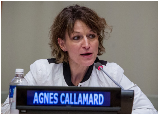
Ms. Agnes Callamard, UN Special Rapporteur on extrajudicial, summary or arbitrary executions.